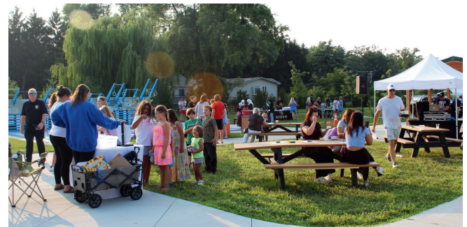
2025 National Night Out 8/2/25 \ Midway Park