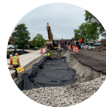
CAPITAL IMPROVEMENT PROGRAM (CIP)