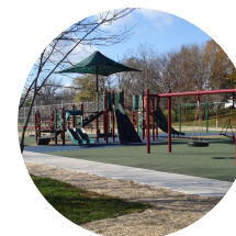
PARKS & RECREATION