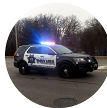
POLICE/ PUBLIC SAFETY