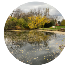
CAPITAL IMPROVEMENT PROGRAM (CIP)