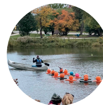
PARKS & RECREATION