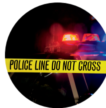
POLICE/ PUBLIC SAFETY