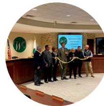
CAPITAL IMPROVEMENT PROGRAM