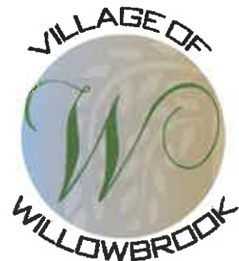
Mayor Frank A. Trilla